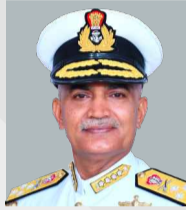
Admiral R Hari Kumar, PVSM, AVSM, VSM, ADC Chief of the Naval Staff