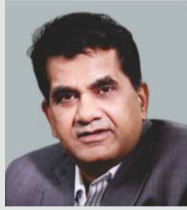
Amitabh Kant India's Sherpa for the G20