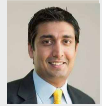
Rishad Premji Executive Chairman Wipro Limited