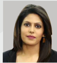
Palki Sharma Journalist, Foreign Affairs