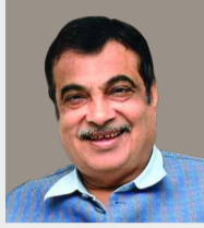
Nitin Gadkari Hon'ble Minister of Road Transport & Highways, Government of India