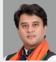
Jyotiraditya M Scindia Hon'ble Minister of Civil Aviation; Steel Government of India