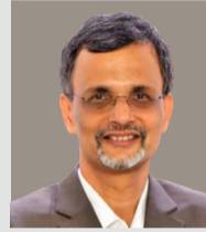
V Anantha Nageswaran Chief Economic Advisor (CEA), Government of India