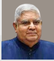
Shri Jagdeep Dhankhar Hon'ble Vice President of India